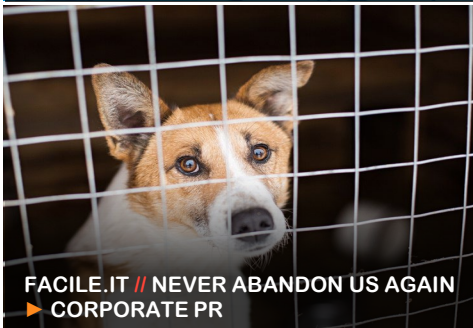
FACILE.IT // NEVER ABANDON US AGAIN ▶ CORPORATE PR