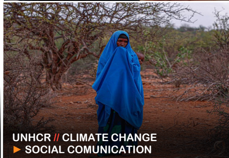
UNHCR // CLIMATE CHANGE ▶ SOCIAL COMMUNICATION