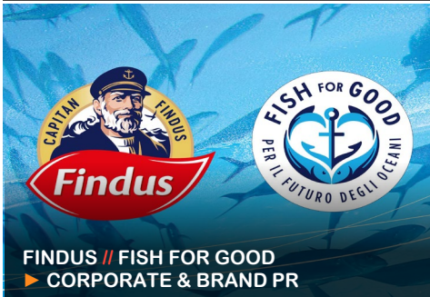
FINDUS // FISH FOR GOOD ▶ CORPORATE & BRAND PR