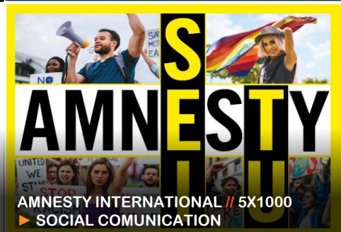
AMNESTY INTERNATIONAL // 5X1000 ▶ SOCIAL COMMUNICATION