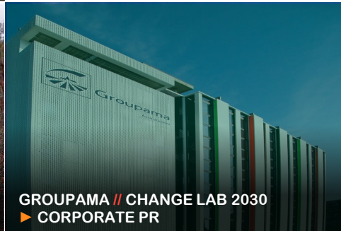
GROUPAMA // CHANGE LAB 2030 ▶ CORPORATE PR