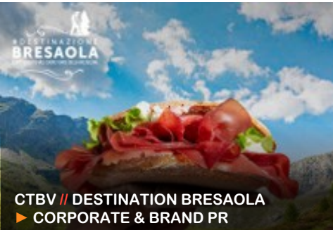
CTBV // DESTINAZIONE BRESAOLA ▶ CORPORATE & BRAND PR