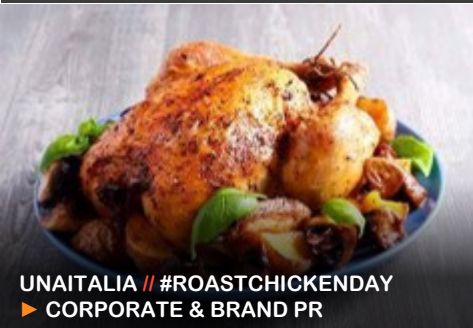
UNAITALIA // #ROASTCHICKENDAY ▶ CORPORATE & BRAND PR