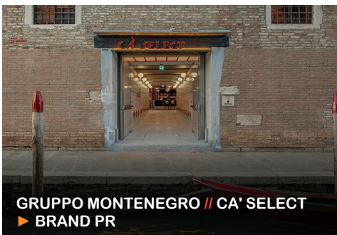
GRUPPO MONTENEGRO // CA' SELECT ▶ BRAND PR