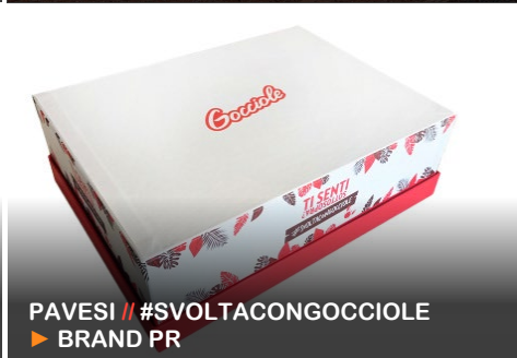
PAVESI // #SVOLTACONGOCIOLE ▶ BRAND PR