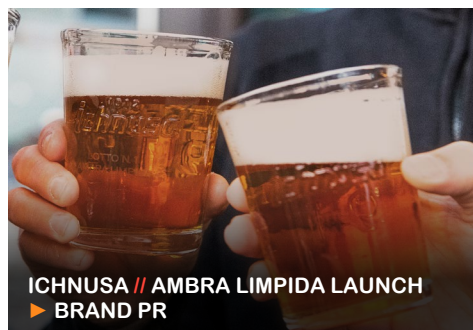
ICHNUSA // AMBRA LIMPIDA LAUNCH ▶ BRAND PR