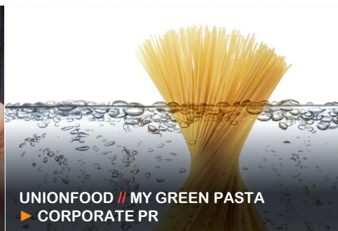
UNIONFOOD // MY GREEN PASTA ▶ CORPORATE PR