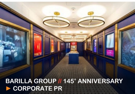
BARILLA GROUP // 145° ANNIVERSARY ▶ CORPORATE PR